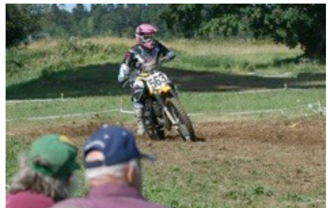
Picture from the Chehalis Vintage races