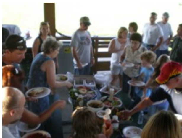
PANTRA Annual Picnic at Liberty Lake Park August 2008

Thanks to everyone who showed up, brought food, and helped cook, to make the picnic at the park another great success.